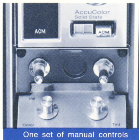
One set of manual controls