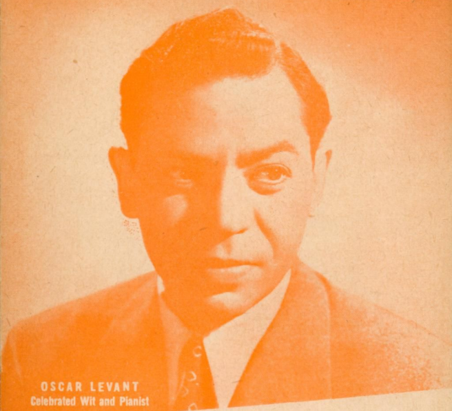
OSCAR LEVANT Celebrated Wit and Pianist